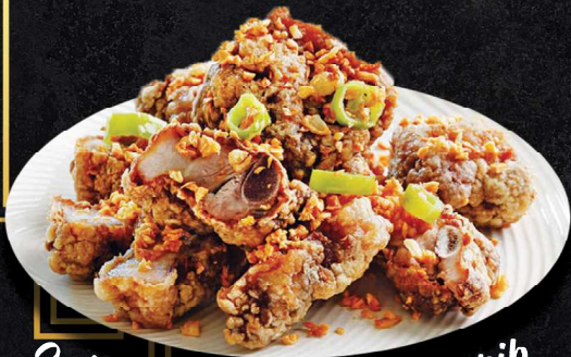
Salt pepper pork spare rib