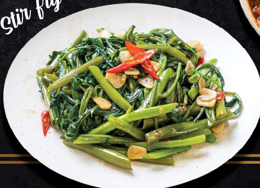
Stir fry morning glory