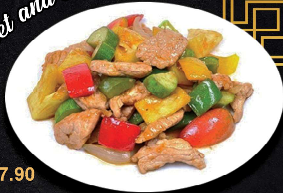
Sweet and sour pork