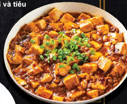
Mapo tofu with beef minced