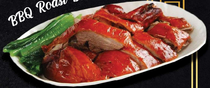
BBQ Roast Duck